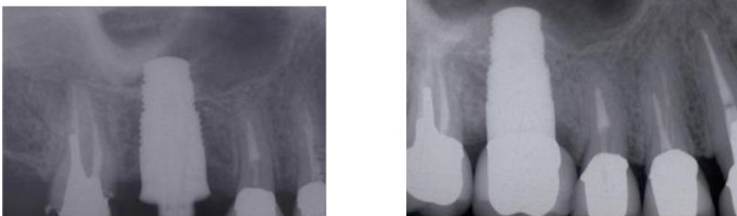
Fig 2,3. Periapical radiograph performed immediately and 2 year later; the modified profile or the cortical bone lining the floor of the maxillary sinus can be identified above the implant.

This particular type of bone is usually found below the sinus floor and, through this technique, is displaced vertically in order to create a new implant alveolar portion. In the final configuration of the surgically created alveolus, the coronal portion of the crest must give primary implant stability.