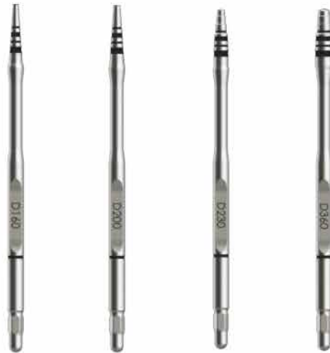
Fig 6. Different types of osteotomes are used.

Such sequence of engaged surface progressively act upon and force internal wall of initial hole radially outward with respect to central axis to create high density bone tissue along substantial portion of length of bore wall.